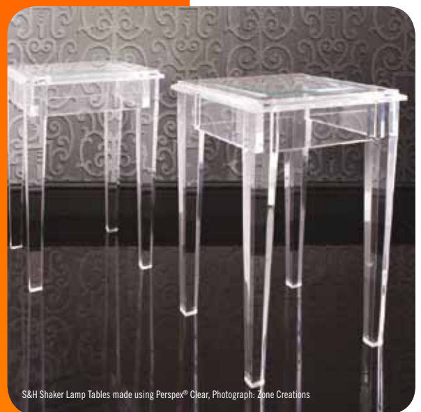
S&H Shaker Lamp Tables made using Perspex® Clear.