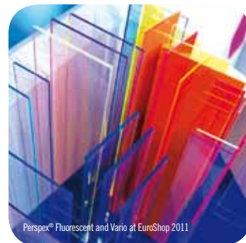
Perspex® Fluorescent and Vario at EuroShop 2011

For further information about our green credentials and targets, please take a look at our environmental brochure: "Shaping a greener, brighter, stronger, more durable world".