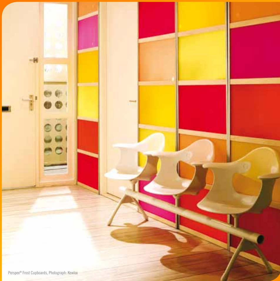
Perspex® Frost Cupboards

Bring your ideas to life Furniture & Interior Design