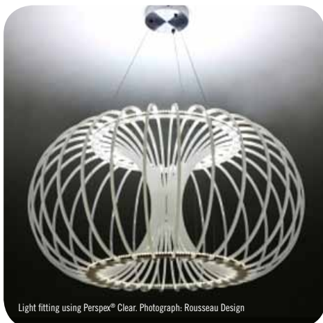
Light fitting using Perspex® Clear.

The beauty of Perspex® is its versatility, so no matter how complex or creative your project, we've got a product that will help it achieve its full potential. Not only is Perspex® incredibly tough and lightweight (half the weight of equivalent glass and five times stronger), it can also be easily laser cut, thermoformed, cold bent, etched, and polished. The possibilities are endless – just like your imagination.