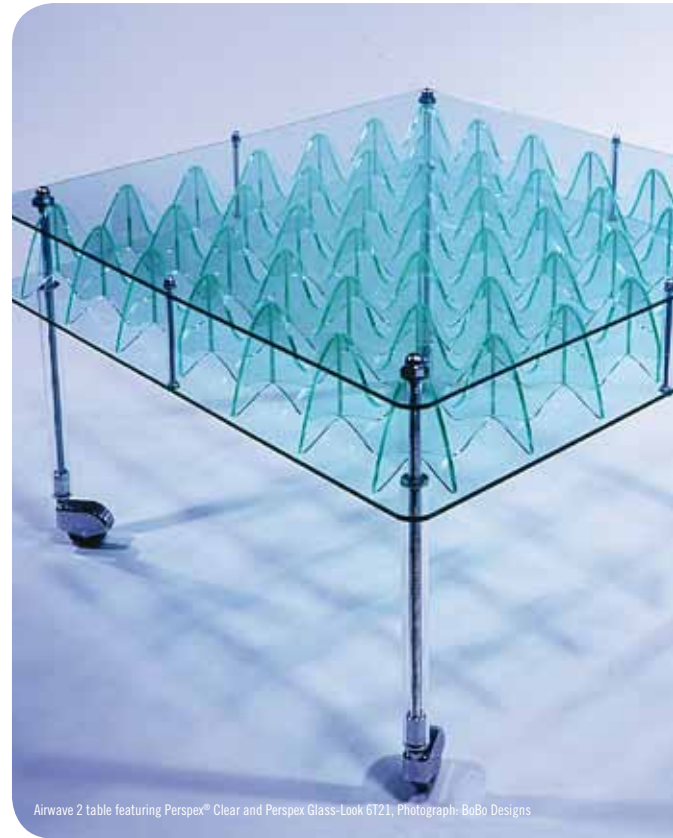
Airwave 2 table featuring Perspex® Clear and Perspex Glass-Look 6T21.

As well as the infinite array of colours available, with complete consistency from batch to batch, Perspex® has an inspiring range of textures and effects that can push your ideas to the limits. It can be transparent, fluorescent or pearlescent; it can be 3D, metallic, or sparkling; it can have a single sided or double sided textured finish, or be purely and classically gloss. So whatever it is you're starting, Perspex® gives it the perfect finish.