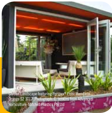
Garden Landscape featuring Perspex® Frost Mandarin Orange S2 3117

Available in different colours, different shades, different textures and different effects; Perspex® can be lasered, shaped, machined, milled, and drilled as well as formed, bent, printed, glued and polished. It lasts too – the outstanding durability of Perspex® means that your designs will stand the test of time in more ways than one.