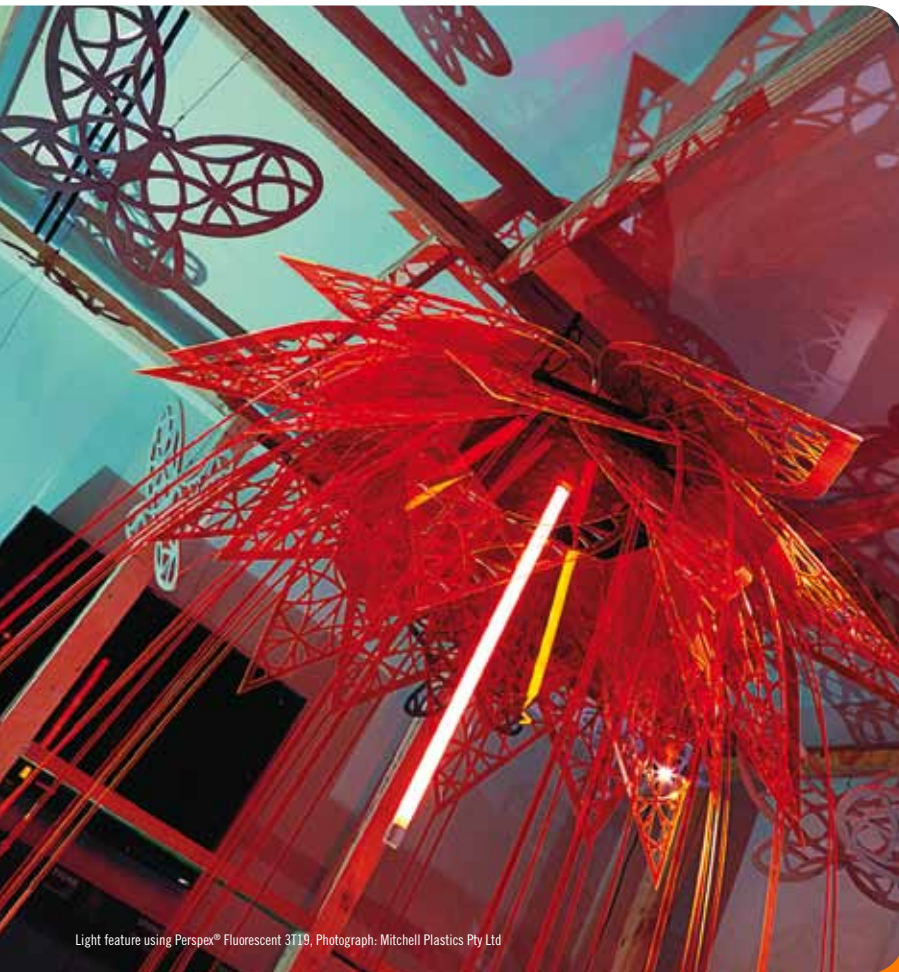
Light feature using Perspex® Fluorescent 3T19.