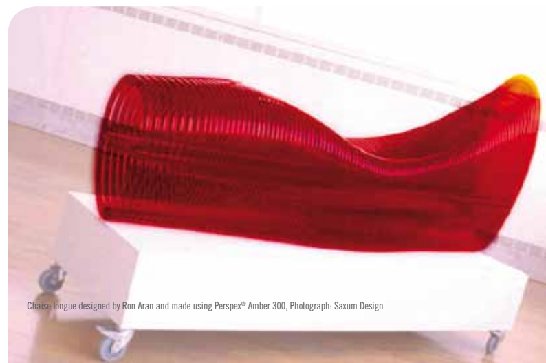
Chaise longue designed by Ron Arad and made using Perspex® Amber 300