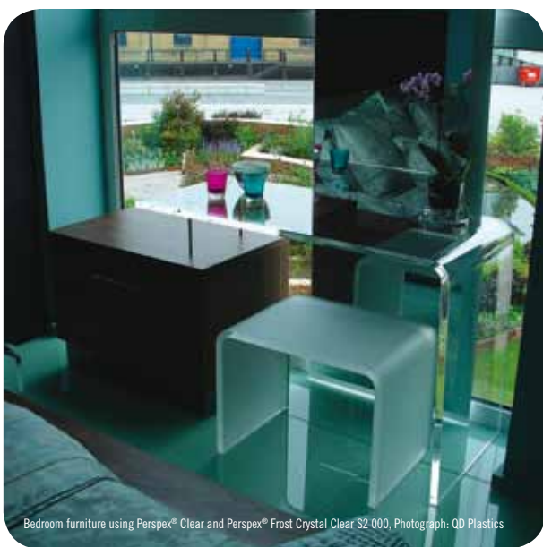
Bedroom furniture using Perspex® Clear and Perspex® Frost Crystal Clear S2 000, Photograph: QD Plastics

For more examples of Perspex® designs take a look at the case studies section and inspiration finder on our website www.perspex.com .