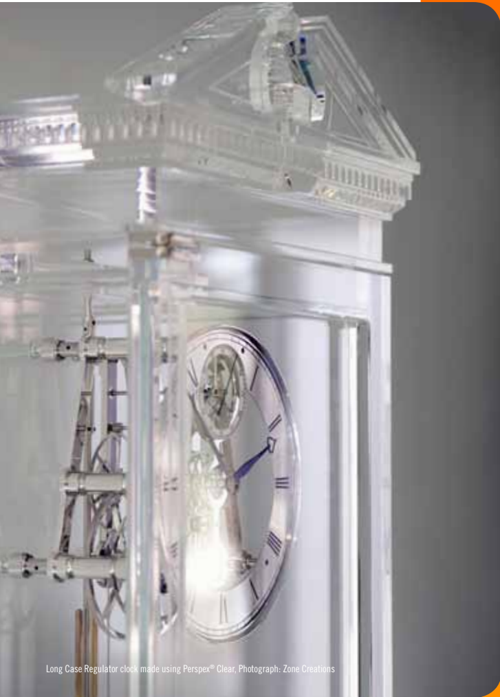
Long Case Regulator clock made using Perspex® Clear

From picture frames to Turner prize nominations, from garden feature walls to interactive art installations, Perspex® helps turn the ordinary into the extraordinary. Here are some of the more unique examples it's been used for: