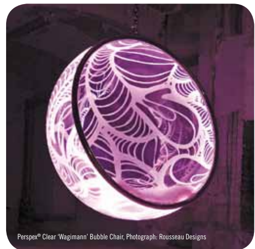
Perspex® Clear 'Wagimann' Bubble Chair