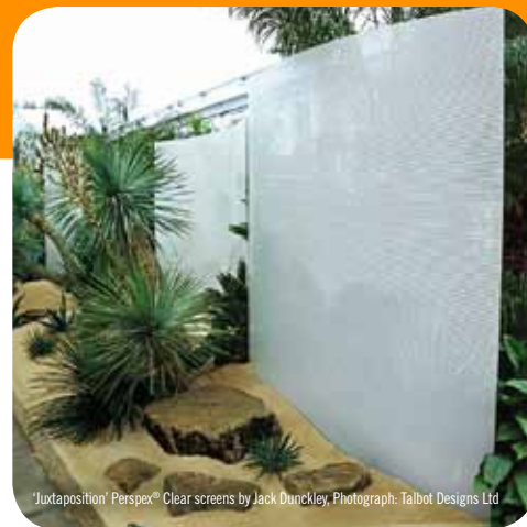
"Juxtaposition" Perspex® Clear screens by Jack Dunckley