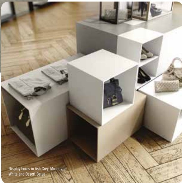
Display boxes in Ash Grey, Moonlight White and Desert Beige