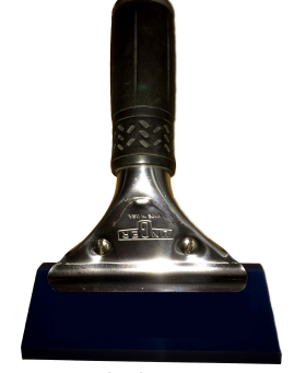
Standard Squeegee (for FASARA)