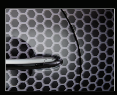
▲ Evenly cut in gaps between car panels.