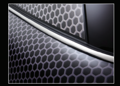
▲ Follow contours and curves on any part of the vehicle.