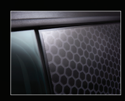
▲ Create a uniform relief cut between window graphic and rubber molding.