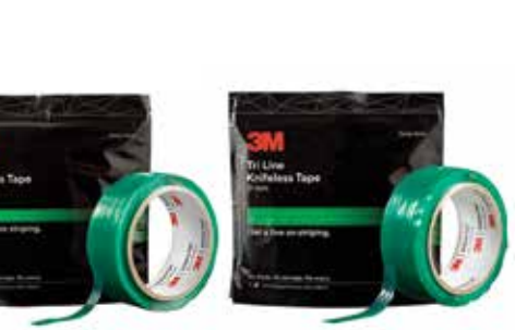
3M<sup>™</sup> Tri Line Knifeless Tape (6mm and 9mm) Ensures accurate, consistent stripe width from one end of the vehicle to the other.